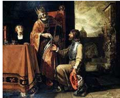
David sends Uriah to the frontlines

The Lord purposely attached David's physical adultery with Bathsheba (and corresponding spiritual adultery toward God) to David being a Man of War (through David sending Uriah to the frontlines during war), because the Lord is linking the spirit of spiritual adultery in the church with the spirit of a Man o' War. This is also why the Lord's curse upon David through the prophet Nathan in 2 Samuel 12:10 was that the sword – an instrument which reflects the spirit of a Man o' War – would not depart from his house.