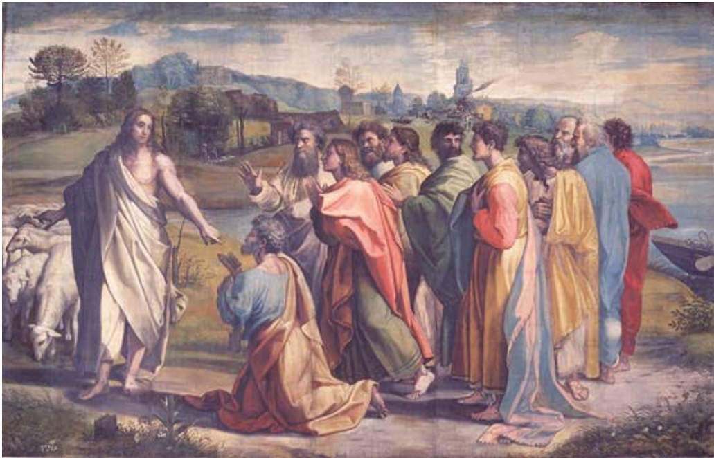
Christ's Charge to Peter, Matthew 16:18-19, by Raphael

18 And I say also unto thee, THAT THOU ART PETER, AND UPON THIS ROCK I WILL BUILD MY CHURCH; and THE GATES OF HELL [represented by the sword-bearing gospel of William III and the Dutch Armada departing from Hellevoetsluis and securing Protestantism for England, toward the building of the Protestant Beast, America, arising out of the Pit] SHALL NOT PREVAIL AGAINST IT.