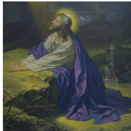
Jesus in the Garden of Gethsemane

Key Understanding: In accordance with the Lord's will. What is actually occurring is that the individuals in question have come into accord with the Lord's will in the first place, making the Lord's will their will. Thus, when those individuals do according to their will, they are actually doing the will of God, which the Lord obviously endorses and enforces.