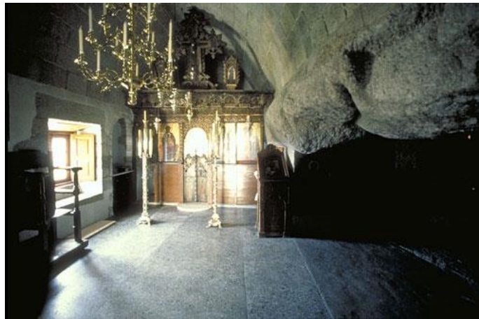
The inside of the Cave of the Apocalypse