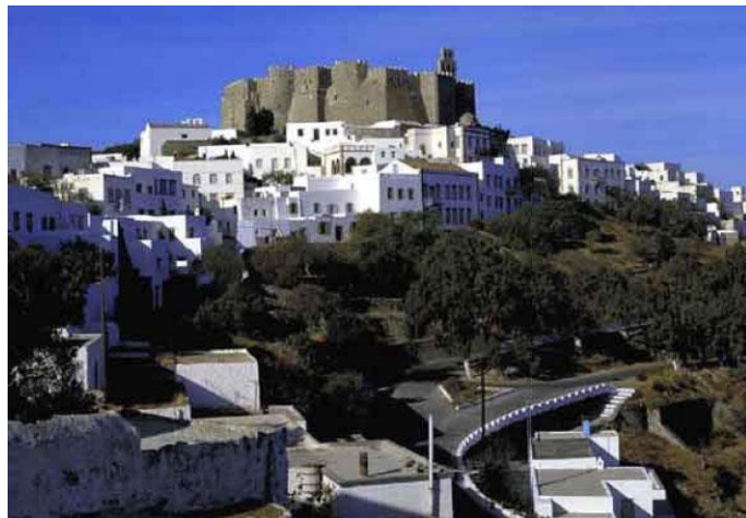
A picture of the Monastery of St. John on Patmos. Below its gray walls are whitewashed buildings of the city of Chora, the capital of the island.

The Monastery of St. John. The Cave of the Apocalypse is situated near the Monastery of St. John , which was erected on the summit of the island of Patmos in 1088 A.D., over the ruins of an ancient temple honoring the goddess Artemis. It was built as a fortress to protect it from pirate attacks. Byzantine Emperor Alexis I Comnenus ceded the entire island to the future monastery. The monastery contains a principal church and five additional chapels.