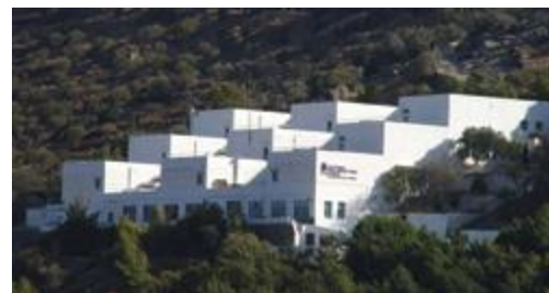
The School of Patmos, near the Cave of the Apocalypse