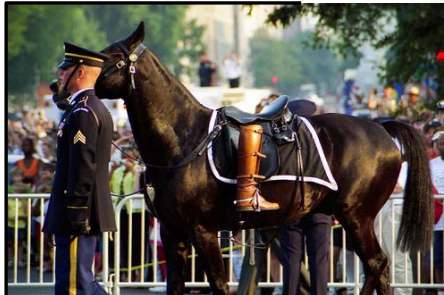
(iv) Reagan and Sgt. York