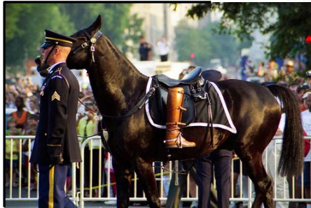
(iv) Reagan and Sgt. York