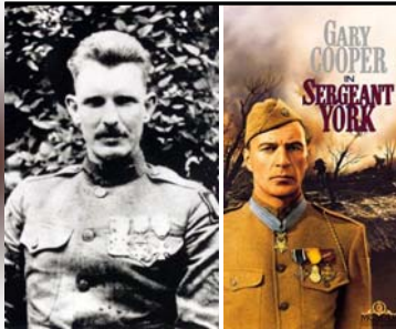
(iii) Wilson and Sgt. York