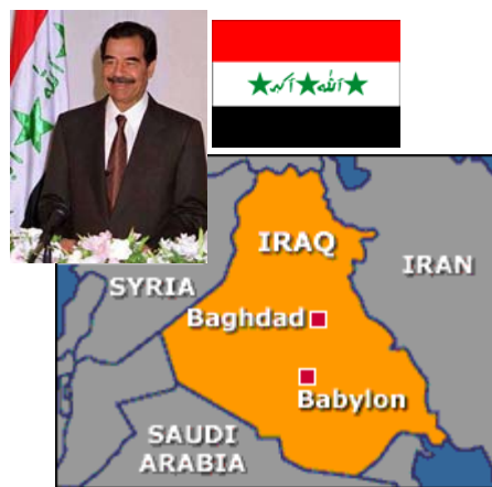
The Saddam Hussein-led regime in Iraq is the pretender Babylon the Great of Revelation 18

Revelation 6:5 (KJV) And when he had opened THE THIRD SEAL , I heard the third beast say, Come and see. And I beheld, and lo A BLACK HORSE ; and he that sat on him had A PAIR OF BALANCES IN HIS HAND [representing the judgment upon the pretender Revelation 17 Scarlet Beast Soviet Union and pretender Revelation 18 Babylon the Great, the regime of Saddam Hussein].