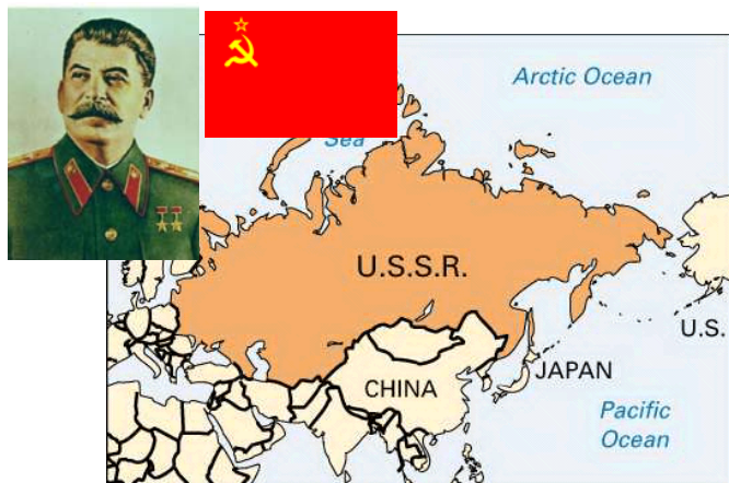
The Soviet Union is the pretender Scarlet Beast of Revelation 17