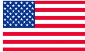
Black Horse Rider