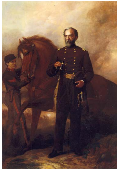
General Meade at Gettysburg

General George Meade. General George Meade was given command of the Army of the Potomac on June 28, 1863, just three days before the July 1-3, 1863, Battle of Gettysburg. Meade remained Commander of the Army of the Potomac through June 28, 1865, after the end of the Civil War. Union General U.S. Grant, the final commander of the entire Union Army, located his headquarters with and supervised the Army of the Potomac from May 1864 to April 1865, providing operational direction, though Meade retained formal command.