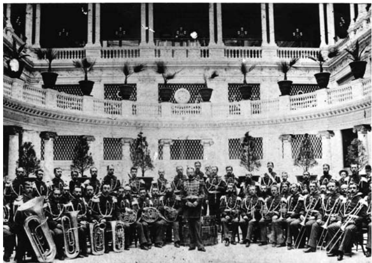
John Philip Sousa and the Marine Band in April 1892 at the Palace Hotel, San Francisco, California

Sousa and World War I. John Philip Sousa was appointed leader of the U.S. Marine Band in 1880, and made the band into one of the finest in the world. In 1892, he obtained his discharge from the Marine Corps and formed his own Sousa Band, giving his first concert in Plainfield, New Jersey, in September 1892. During the next 40 years, “Sousa’s Band” was the elite of wind-powered musical organizations and one of the finest ensembles of any kind. Sousa quickly became famous throughout America and Europe. When America entered World War I, Sousa once again turned to military life to serve his country.