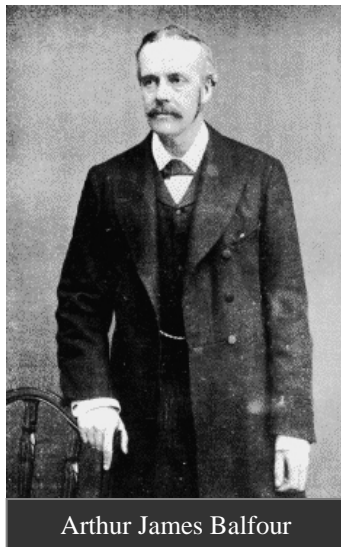
Arthur James Balfour

In the midst of World War I, the Balfour Declaration was made in a November 2, 1917, letter from British Foreign Secretary Arthur James Balfour to Lord Rothschild (Walter Rothschild, 2 nd Baron Rothschild), a leader of the British Jewish Community. The letter stated the position agreed upon at a British Cabinet meeting on October 31, 1917, that the British government – upon the defeat of the Ottoman Turks – supported Zionist plans for a Jewish “national home” in Palestine, with the condition that nothing should be done which might prejudice the rights of existing communities there.