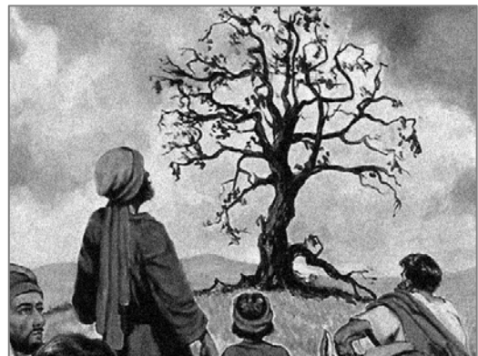
Tuesday – The disciples pass by the cursed fig tree and see that it has already died

On the Tuesday before the crucifixion, the disciples pass by the cursed fig tree and see that it has already died (Matthew 21:20-22; Mark 11:20-24). On that day as well was what is known as the Olivet discourse. Jesus had departed from the temple and gone to the Mount of Olives. The disciples then asked