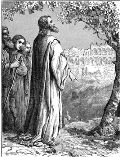
Monday – Jesus curses the barren fig tree

On the Sunday before the crucifixion, Jesus enters Jerusalem triumphantly (Matthew 21:1-9; Mark 11:1-11; Luke 19:28-44). He is greeted by a great multitude with palms in their hands.