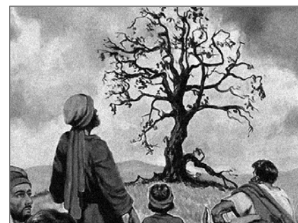
The disciples pass by the cursed fig tree and see that it has already died

Key Understanding: Many theologians correctly interpret the barren fig tree of Matthew 21:19 as representative of the Jews in Jerusalem and Judah at that time, existing as a fig tree and having leaves, but – as evidenced by their forthcoming rejection of the Messiah – not bearing fruit . Furthermore, the cursing of the fig tree with no fruit and its immediate withering and dying were essentially symbolic of the imminent dispersion of the Jews from the Promised Land by the Romans in 70 A.D. Thus, the (Matthew 21)