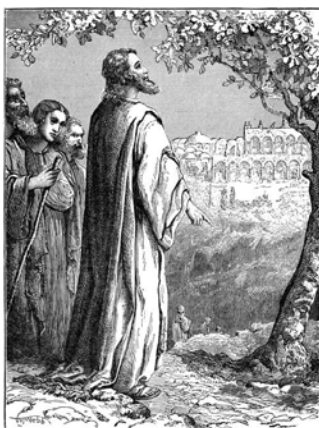
Jesus curses the barren fig tree

14 And Jesus answered and said unto it, No man eat fruit of thee hereafter for ever. And his disciples heard it.