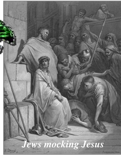
Jews mocking Jesus

The cursing of the fig tree and its immediate withering and dying were symbolic of the imminent dispersion of the Jews from the Promised Land by the Romans