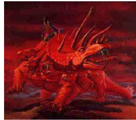
The Scarlet Beast out of the Pit in Revelation 17

Revelation 13:16-18 (KJV) And he [if you read the verses leading up to Revelation 13:16, you will understand that the he here is actually referring to a second beast, the Beast out of the Earth in Revelation 13:11 (which, in one of its major fulfillments, is the false prophet ), rather than the first beast, the Beast out of the Sea in Revelation 13:1 (which is the Beast out of the Pit in Revelation 17:08)] causeth all, both small and great, rich and poor,