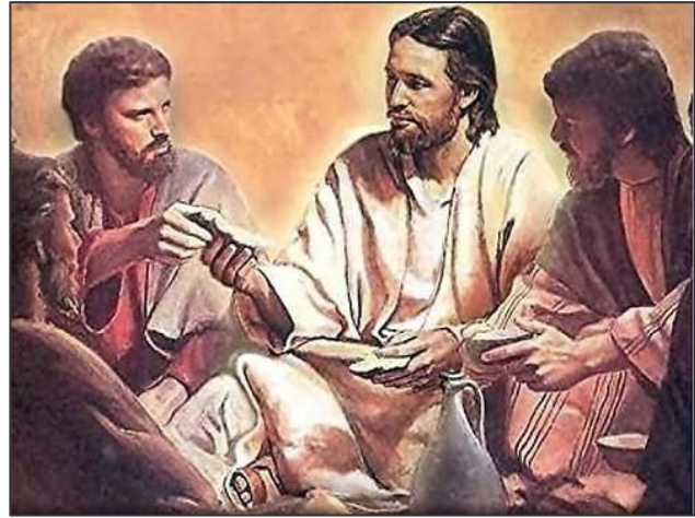
Jesus as the Bread of Life

52 The Jews therefore strove among themselves, saying, How can this man give us his flesh to eat?