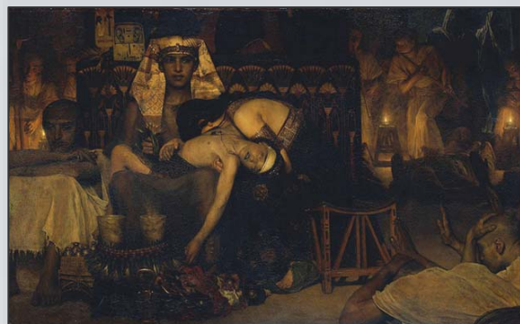
The death of Pharaoh's firstborn son

14 " This is a day you are to commemorate; for the generations to come you shall celebrate it as a festival to the LORD—a lasting ordinance.