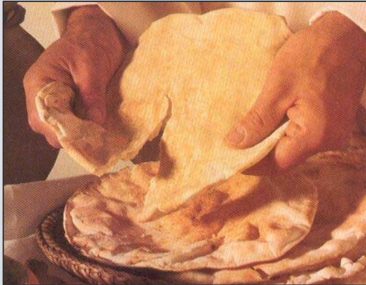
The Feast of Unleavened Bread commemorated . . .

[unleavened bread]. On the first day remove the yeast from your houses, for whoever eats anything with yeast in it from the first day through the seventh must be cut off from Israel.