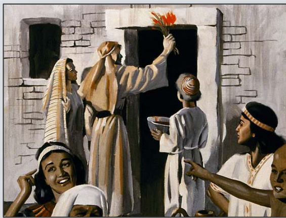
The Feast of Passover commemorated . . .

4 If any household is too small for a whole lamb, they must share one with their nearest neighbor, having taken into account the number of people there are. You are to determine the amount of lamb needed in accordance with what each person will eat.