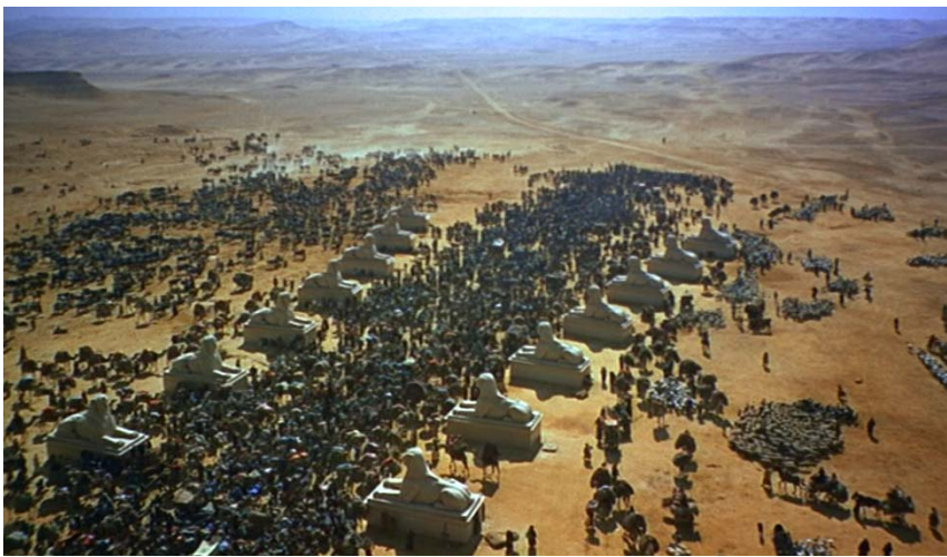
Israel’s flight from Egypt as portrayed in Cecil B. DeMille’s 1956 film The Ten Commandments

Exodus 12:30-39 (KJV) Pharaoh and all his officials and all the Egyptians got up during the night, and there was loud wailing in Egypt, for there was not a house without someone dead.