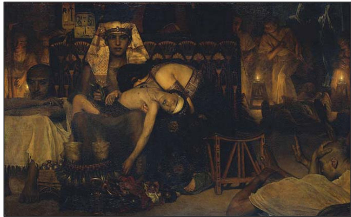
The death of Pharaoh's firstborn son

14 "This is a day you are to commemorate; for the generations to come you shall celebrate it as a festival to the LORD — a lasting ordinance.