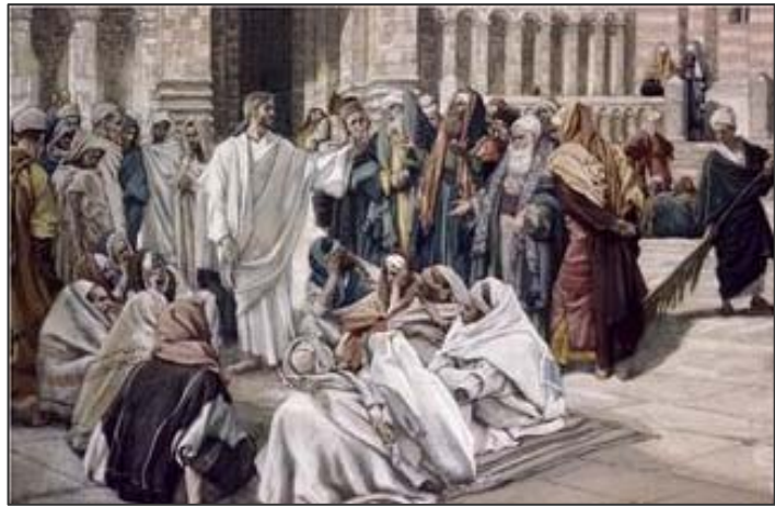
Jesus denouncing the Pharisees

7 And greetings in the markets, and to be called of men, Rabbi, Rabbi.