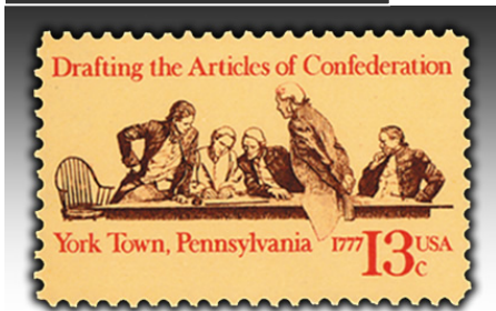
James Lovell signed the Articles of Confederation. The bicentennial of the Articles of Confederation was commemorated on this U.S. postage stamp in 1977.

There are two famous men named James Lovell in American history. The first James Lovell was a Founding Father of the United States of America, connected fully to the beginning of America’s history and the defeat of the “forerunner” 7 th Head Great Britain in the Revolutionary War. The second James Lovell – astronaut James Lovell – was instrumental in the Space Race defeat of the 7 th Head Red Beast Soviet Union in the Cold War.