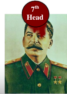
The defeat of the Soviet Union and Communism

There are two famous men named James Lovell in American history. The first James Lovell was a Founding Father of the United States of America, connected fully to the beginning of America’s history and the defeat of the “forerunner” 7 th Head Great Britain in the Revolutionary War. The second James Lovell – astronaut James Lovell – was instrumental in the Space Race defeat of the 7 th Head Red Beast Soviet Union in the Cold War.