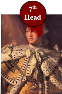
The defeat of Great Britain and kings