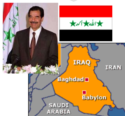
The Saddam Hussein-led regime in Iraq is the pretender Babylon the Great of Revelation 18