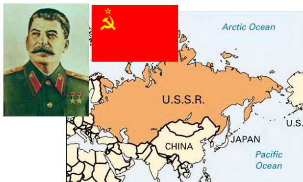
The Soviet Union is the pretender Scarlet Beast of Revelation 17