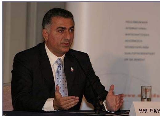
(above) Reza Cyrus Pahlavi in Austria, October 24, 2007