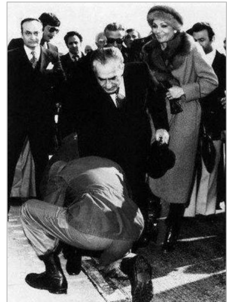
January 16, 1979, Tehran, Iran. An Iranian soldier kisses the feet of Shah Mohammed Reza Pahlavi as aides of the Monarch look on grimly and Empress Farah looks away with a big smile.

1979 November 4 The Iran hostage crisis began as 63 American diplomats were taken hostage at the American embassy in Tehran, Iran, by militant student followers of Ayatollah Khomeini who demanded the return of Shah Mohammed Reza Pahlavi for trial. He was undergoing medical treatment in New York City. The students held 52 American hostages for 444 days. The hostages were released on January 20, 1981, the day of the inauguration of President Ronald Reagan.