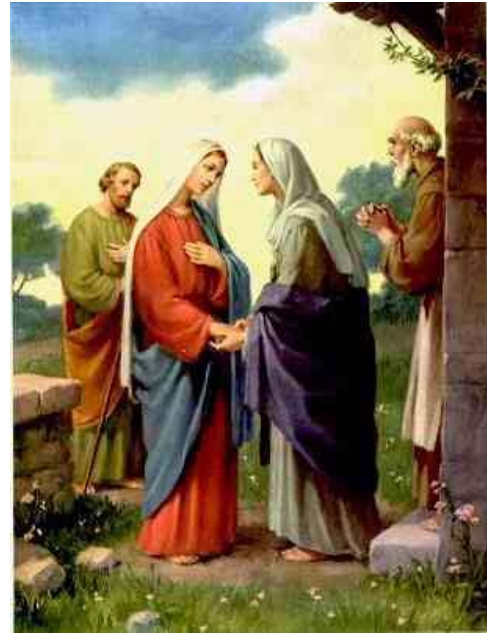
Mary tells her cousin Elizabeth the news

38 And Mary said, Behold the handmaid of the Lord; be it unto me according to thy word. And the angel departed from her.