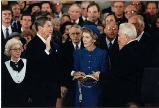
January 20, 1981, Inauguration of Ronald Reagan