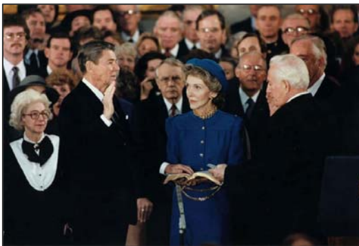
January 20, 1981, Inauguration of Ronald Reagan