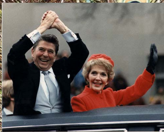
The new Peacock Throne

January 20, 1981. It was (i) the January 20, 1981, end of the Iran Hostage Crisis, coupled purposefully both historically and prophetically with (ii) the January 20, 1981, inauguration of Ronald Reagan, that constituted the start of the rise of America to mature in its role as the second (but counterfeit ) ‘Cyrus the Great’ Media-Persia.