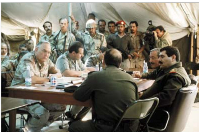
Here is a picture of the March 3, 1991, surrender of Iraq to H. Norman Schwarzkopf, Jr.

Daniel 5:25-28 (KJV) And this is the writing that was written, MENE, MENE, TEKEL, UPHARSIN. 26 This is the interpretation of the thing: MENE; God hath numbered thy kingdom, and finished it. 27 TEKEL; Thou art weighed in the balances, and art found wanting. 28 PERES; Thy kingdom is divided, and given to the Medes and Persians.