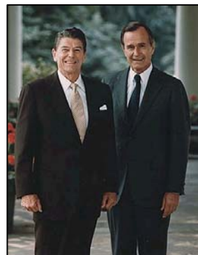
Ronald Wilson Reagan is attached to the incomplete 1991 Gulf War defeat of Saddam Hussein’s Iraq