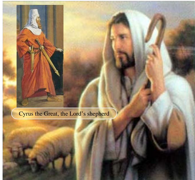
Cyrus the Great, the Lord's shepherd

Cyrus the Great/Media-Persia and the rebuilding of Jerusalem and the Temple. In Isaiah 44:28 the prophetic (and what became the historical) relationship between Cyrus the Great/Media-Persia and the (re)building of Jerusalem and the Temple is seen. After the end of the captivity of the Jews in Nebuchadnezzar's Babylon, the start of the rebuilding of Jerusalem and especially the building of the Second (Zerubbabel's) Temple were accomplished by Zerubbabel and Joshua, allowed and commissioned by Cyrus the Great of Media-Persia.