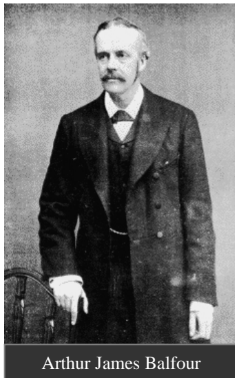
Arthur James Balfour

In the midst of World War I, the Balfour Declaration was made in a November 2, 1917, letter from British Foreign Secretary Arthur James Balfour to Lord Rothschild (Walter Rothschild, 2 nd Baron Rothschild), a leader of the British Jewish Community. The letter stated the position agreed upon at a British Cabinet meeting on October 31, 1917, that the British government – upon the defeat of the Ottoman Turks – supported Zionist plans for a Jewish “national home” in Palestine, with the condition that nothing should be done which might prejudice the rights of existing communities there.