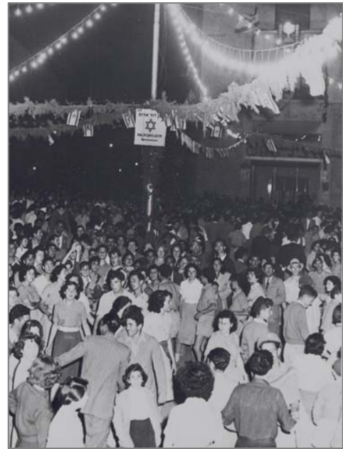
Crowds in Tel Aviv celebrate Independence Day

May 15, 1948, Arab armies attack Israel. Arab states issued their response statement and Arab armies, chiefly from Egypt, Syria, Lebanon, Iraq, and Jordan (called Transjordan until 1949), attacked Israel, aiming to destroy the new nation. [By early 1949, Israel had defeated the Arabs and gained control of about half the land planned for the new Arab state. Egypt and Jordan held the rest of Palestine. Israel controlled the western half of Jerusalem and Jordan held the eastern half. Israel incorporated the gained territory into the fledgling country, adding about 150,000 resentful Arabs to its population. Hundreds of thousands of other Palestinian Arabs fled their homes and settled as refugees in parts of Palestine not under Israeli control and in neighboring Arab countries. By mid-1949, Israel had signed armistice agreements with Egypt,