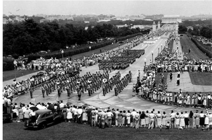
Funeral of General John J. Pershing in Washington D.C.

July 15, 1948, the death of General John J. Pershing. Exactly 2 months after the birth of Israel came the July 15, 1948, death of General John J. Pershing of World War I. [Reference the bios of General John Pershing in Unsealings #1235–#1236.] [The Lord’s use of the 2-month date change was introduced in Unsealing #242, and was discussed further with examples generally being shared in Unsealings #428–#430, #465, #472, #660, #673, #732, #738, #742, and most recently in #1243, with the subject matter of the dates of the 11/6 birth and 3/6 death of John Philip Sousa correlating with Habakkuk 1:6.]