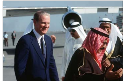
James Baker arriving in Kuwait, 1991

part (a) Isaiah 44:28 (KJV) [Thus saith the Lord] THAT SAITH OF CYRUS, HE IS MY SHEPHERD, and shall perform all my pleasure: