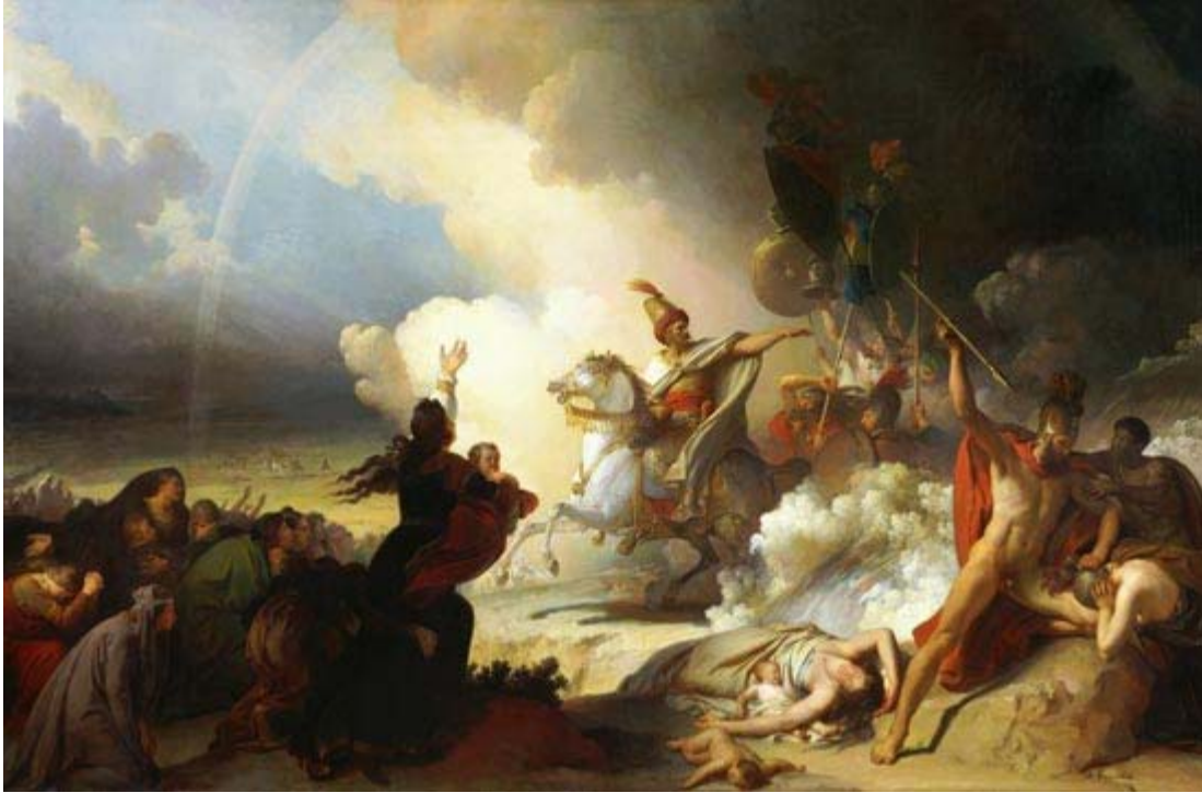
Saladin I (1138-93) in Jerusalem, by Alexandre Evariste Fragonard