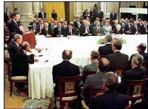
U.S. President George H. W. Bush encourages Arabs and Israelis to “lay down the past” in his opening speech to the Middle East peace conference in Spain, October 30, 1991

part (b) EVEN SAYING TO JERUSALEM, THOU SHALT BE BUILT; AND TO THE TEMPLE, THY FOUNDATION SHALL BE LAID.