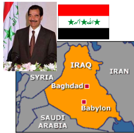
The Saddam Hussein-led regime in Iraq is the pretender Babylon the Great of Revelation 18

Key Understanding: Double victories by the U.S. led to the September 13, 1993, peace accord. The Revelation 6:5 Pair of Balances defeats by the U.S. of the Soviet Union (the pretender Scarlet Beast of Revelation 17) and Saddam Hussein-led Iraq (the pretender Babylon the Great of Revelation 18) were both required to bring about the September 13, 1993, accord between the PLO and Israel.