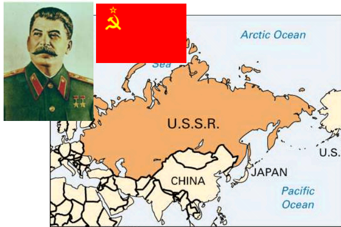
The Soviet Union is the pretender Scarlet Beast of Revelation 17