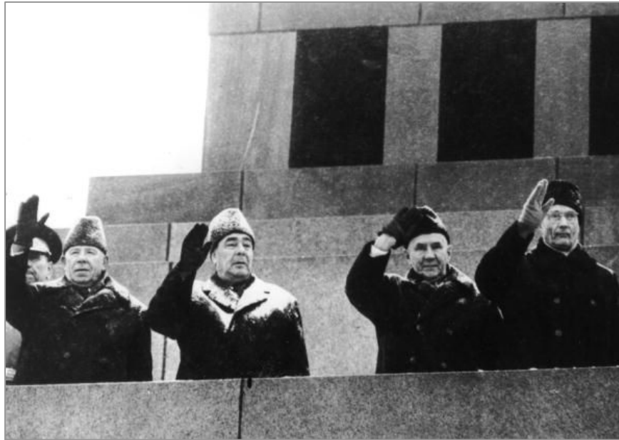
Soviet leader Leonid I. Brezhnev (1906-1982) and fellow Politburo members (left to right), Nikolai V. Podgorny (1903-1983), Brezhnev, Alexei N. Kosygin (1904-1980), Mikhail A. Suslov (1902-1982)

9 And he said, Go thy way, Daniel: for the words are closed up and sealed till THE TIME OF THE END. [The December 9, 1991, "One Nation Under God" Time Magazine cover and story is a part of the revealing of Daniel 12:9.]