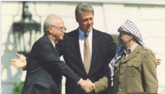
Yitzhak Rabin and Yassir Arafat at the White House on September 13, 1993

Key Understanding #2: Thus, the January 20, 1993-birthed administration(s) of President Bill Clinton were tied prophetically/historically to the themes of (re)building the City of Jerusalem (and Israel) and/or the Wall (the defenses) of Jerusalem (and Israel) and/or the Temple , in the latter day(s) ( counterfeit ) fulfillment of Isaiah 44:28.