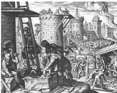
Rebuilding the City

Review: The City, the Wall, the Temple . When Jerusalem and Judah were (re)built in the time of the rule of Media-Persia, the rebuilding focused on (i) the City (of Jerusalem), (ii) the Wall (of Jerusalem), and (iii) the Temple (at Jerusalem). Our initial focus has been on the City . Our new focus will be on the Wall .