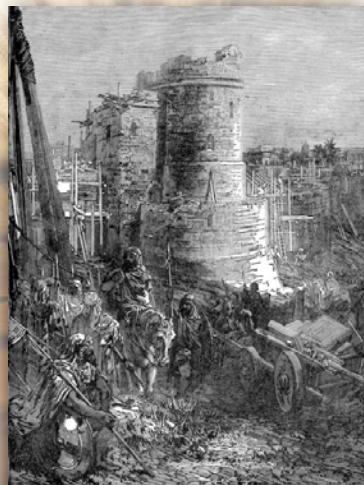
Rebuilding the Wall