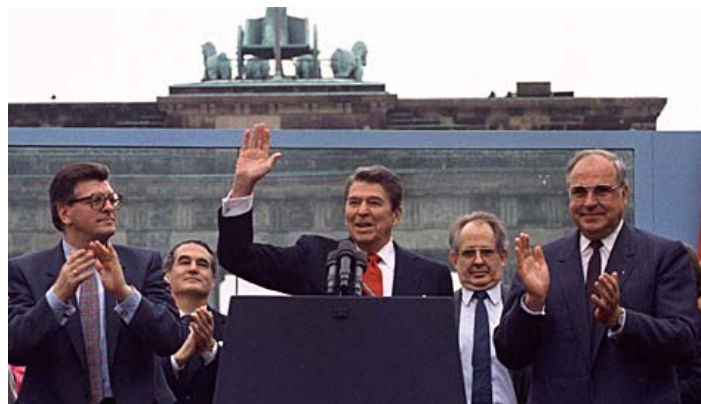
Ronald Reagan at the Brandenburg Gate, June 12, 1987

Nehemiah 2:17 (KJV) Then said I [Nehemiah] unto them, Ye see the distress that we are in, how JERUSALEM LIETH WASTE, and the gates thereof are burned with fire: come, and LET US BUILD UP THE WALL OF JERUSALEM, that we be no more a reproach.