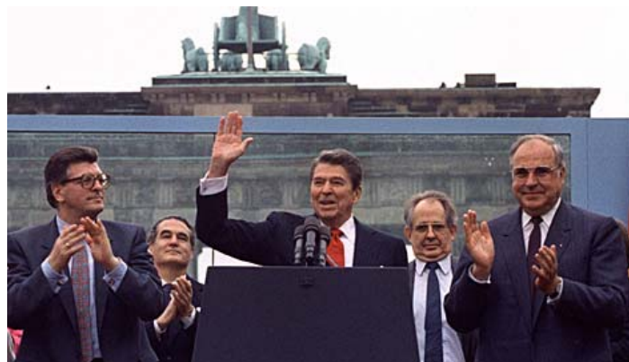
Ronald Reagan at the Brandenburg Gate, June 12, 1987

Nehemiah 2:17 (KJV) Then said I [Nehemiah] unto them, Ye see the distress that we are in, how JERUSALEM LIETH WASTE, and the gates thereof are burned with fire: come, and LET US BUILD UP THE WALL OF JERUSALEM, that we be no more a reproach.