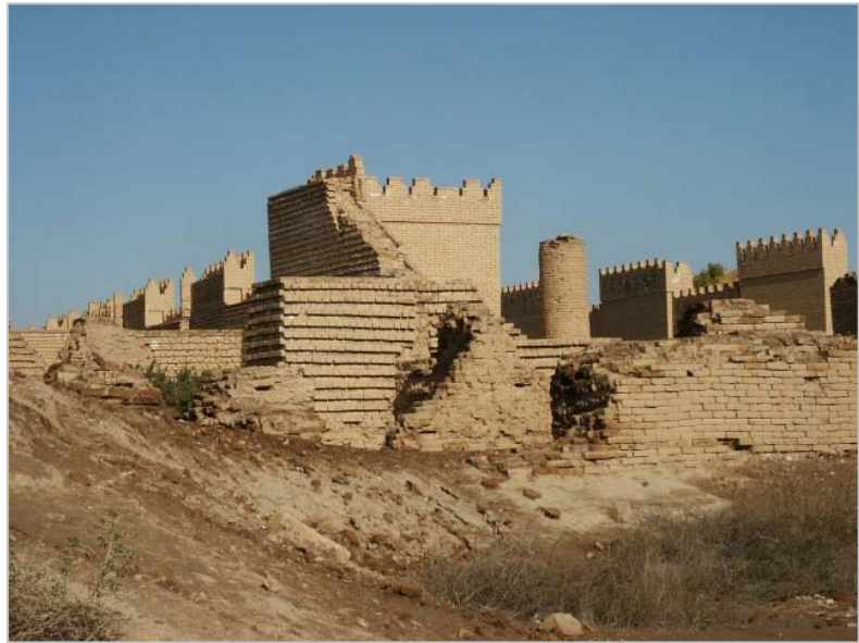
Some of the original walls of ancient Babylon

49 As Babylon hath caused the slain of Israel to fall, so at Babylon shall fall the slain of all the earth.