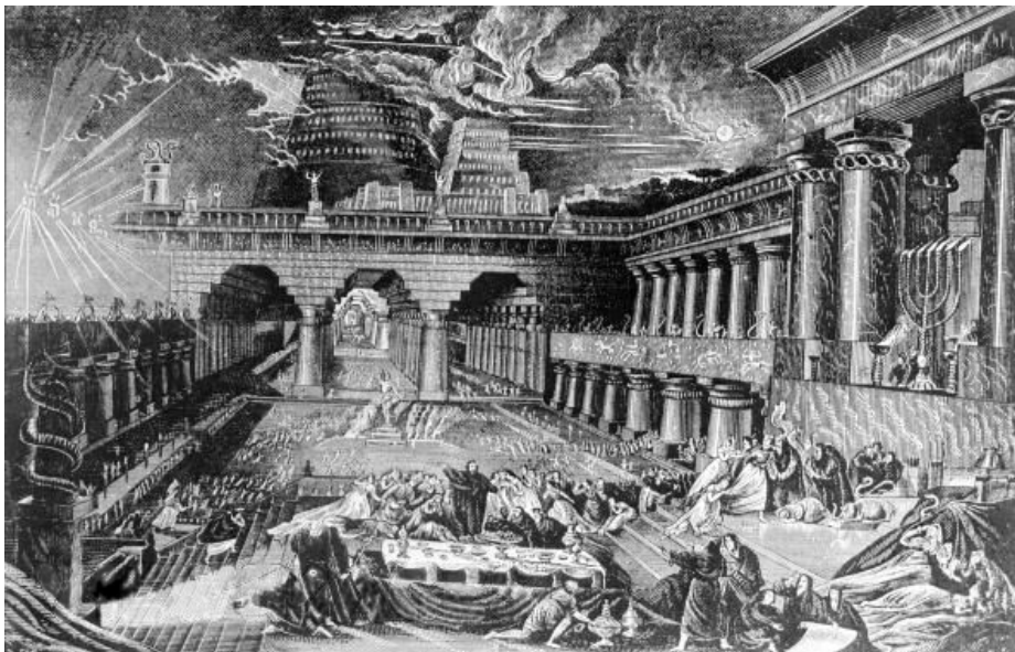
The Fall of Babylon The wrath of God over Belshazzar's feast signifies impending doom for Babylon, 539 B.C.

Daniel 5:28 (KJV) Peres; Thy kingdom is divided, and given to the Medes and Persians.