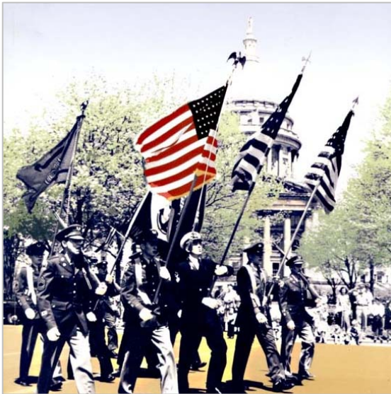
The ‘Body of Americans’ has prophetically represented the entity of the Lord’s Holy Nation/Holy Temple Gentile Christian New Israel

Said yet another way, neither the Christian New Israel (the Body of Americans) nor the Jewish new Israel (the Body of Israelis) is led by the Spirit of the living God.