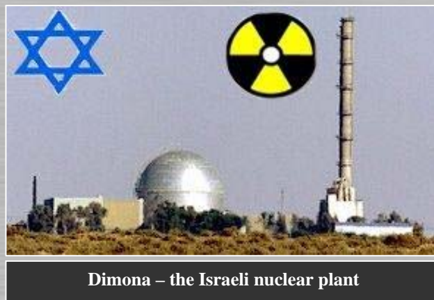
Dimona – the Israeli nuclear plant