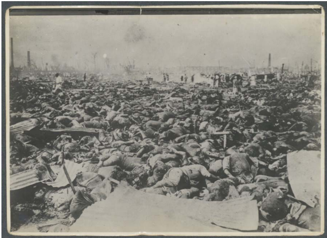
Aftermath of the “Rain of Ruin”

3) to despoil one, strip her of her treasures