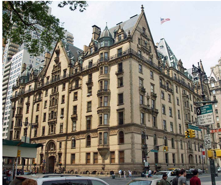
The Dakota, located on the west side of Central Park in Manhattan, was used in the movie Rosemary's Baby as the setting for the apartment house in Manhattan called the Bramford, into which the Woodhouses moved. John Lennon lived in the Dakota over a decade later. The Dakota was the site of his assassination on December 8, 1980.

Guy agrees to cooperate with Roman to allow Satan to have a child through Rosemary. The plan, unbeknownst to Rosemary, is to give the baby to Satan when it is born. Guy decided that the best time to conceive according to her menstrual cycle would be Monday, October 4, and Tuesday, October 5, 1965. The plan began with Minnie Castevet bringing over two cups of Mousse au chocolate on October 4 following dinner. Rosemary’s cup was laced with a sedative. During her extreme wooziness, she is brought to a bed and becomes the central part of a Satanic ceremonial orgy where she becomes impregnated by Satan himself. Though sedated, she had opened her eyes and “looked into yellow furnace-eyes” and had smelled sulphur and tannis root.