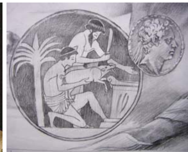
Antiochus IV Epiphanes