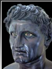
Seleucus I Nicator ruled Mesopotamia and Iran