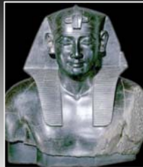
Ptolemy I ruled Levant and Egypt