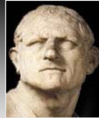
Lysimachus ruled Thrace