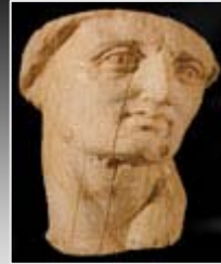
Cassander ruled Greece