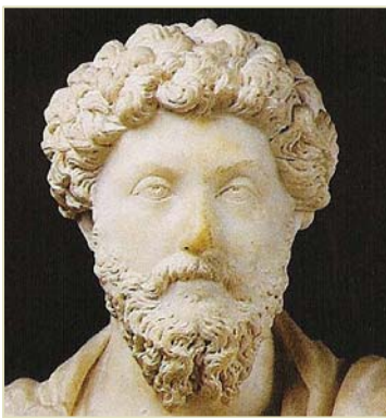
Antiochus IV Epiphanes

Daniel 8:9 (KJV) And OUT OF ONE OF THEM [the Syrian kingdom of Seleucus, or the Seleucid Empire] CAME FORTH A LITTLE HORN, which waxed EXCEEDING GREAT, toward THE SOUTH, and toward THE EAST, and toward THE PLEASANT LAND [Antiochus IV Epiphanes, but the verse should be viewed prophetically with his father, Antiochus III the Great, prominently and powerfully in the foreground, with the name Antiochus III the Great even reflecting the words “waxed exceeding great”].