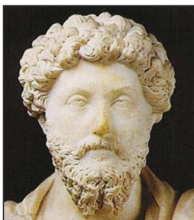
Antiochus IV Epiphanes

Daniel 8:9 (KJV) And OUT OF ONE OF THEM [the Syrian kingdom of Seleucus, or the Seleucid Empire] CAME FORTH A LITTLE HORN, which waxed EXCEEDING GREAT, toward THE SOUTH, and toward THE EAST, and toward THE PLEASANT LAND [Antiochus IV Epiphanes, but the verse should be viewed prophetically with his father, Antiochus III the Great, prominently and powerfully in the foreground, with the name Antiochus III the Great even reflecting the words “waxed exceeding great”].