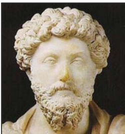
Antiochus IV Epiphanes

Daniel 8:9 (KJV) And OUT OF ONE OF THEM [the Syrian kingdom of Seleucus, or the Seleucid Empire] CAME FORTH A LITTLE HORN, which waxed EXCEEDING GREAT, toward THE SOUTH, and toward THE EAST, and toward THE PLEASANT LAND [Antiochus IV Epiphanes, but the verse should be viewed prophetically with his father, Antiochus III the Great, prominently and powerfully in the foreground, with the name Antiochus III the Great even reflecting the words “waxed exceeding great”].