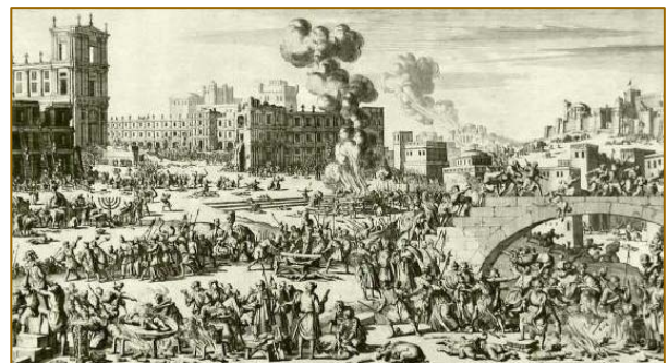
Antiochus IV desecrated the Temple at Jerusalem

11 Yea, he magnified himself even to the prince of the host, and by him the daily sacrifice was taken away, and THE PLACE OF HIS SANCTUARY WAS CAST DOWN.