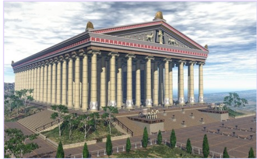
The birth of Alexander the Great is said to have occurred at the time of the destruction of the Temple of Diana

Great died young, on June 10, 323 B.C., having taken seriously ill with malaria at Babylon]; and for it [from it] came up FOUR NOTABLE ONES [the 4 (four) prominent kingdoms of Ptolemy, Seleucus, Cassander, and Lysimachus] TOWARD THE FOUR WINDS OF HEAVEN. [Daniel 8:8 in the NIV says . . . The goat became very great, but at the height of his power his large horn was broken off, and in its place four prominent horns grew up toward the four winds of heaven.]