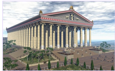
The birth of Alexander the Great is said to have occurred at the time of the destruction of the Temple of Diana

with malaria at Babylon]; and for it [from it] came up FOUR NOTABLE ONES [the 4 (four) prominent kingdoms of Ptolemy, Seleucus, Cassander, and Lysimachus] TOWARD THE FOUR WINDS OF HEAVEN . [Daniel 8:8 in the NIV says . . . The goat became very great, but at the height of his power his large horn was broken off, and in its place four prominent horns grew up toward the four winds of heaven.]