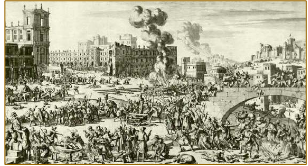
Antiochus IV desecrated the Temple at Jerusalem

11 Yea, he magnified himself even to the prince of the host, and by him the daily sacrifice was taken away, and THE PLACE OF HIS [the Lord's] SANCTUARY WAS CAST DOWN.