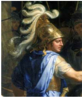
Alexander the Great

Key Understanding: The birth of Alexander the Great and the simultaneous destruction of the Temple of Diana at Ephesus point to the antichrist role of Antiochus IV and the desecration of the Jewish Temple at Jerusalem. The Lord ordained the birth of Alexander the Great and the simultaneous destruction of the Temple of Diana at Ephesus (in either fact or legend) to point to the antichrist role of Alexander’s successor, Antiochus IV Epiphanes , in the desecration of the Jewish Temple at Jerusalem , and, more expansively, to point to the fact that the enormous historical/prophetic story that begins with Alexander the Great and passes through Antiochus IV Epiphanes surrounds the theme of the desecration and destruction of the Temple(s) of the Lord (though the Temple of Diana was clearly not a Temple of the Lord). It is a foreshadowing of future events.