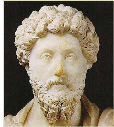
Antiochus IV Epiphanes

29 And the land was moved for the inhabitants thereof, and all the house of Jacob was covered with confusion.