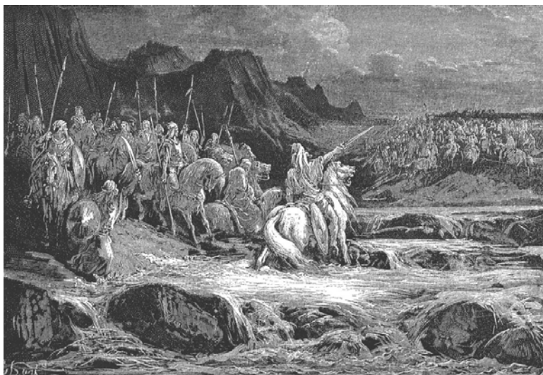
The victor, Judas Maccabeus, 2 Maccabees 10:1, by Gustave Dore

The ensuing Maccabee Revolt (167 BCE) began a twenty-five year period of Jewish independence potentiated by the timely collapse of the Seleucid Empire, which was eliminated by the rising regional power of the Roman Republic. However, the same power vacuum that enabled Jewish self-