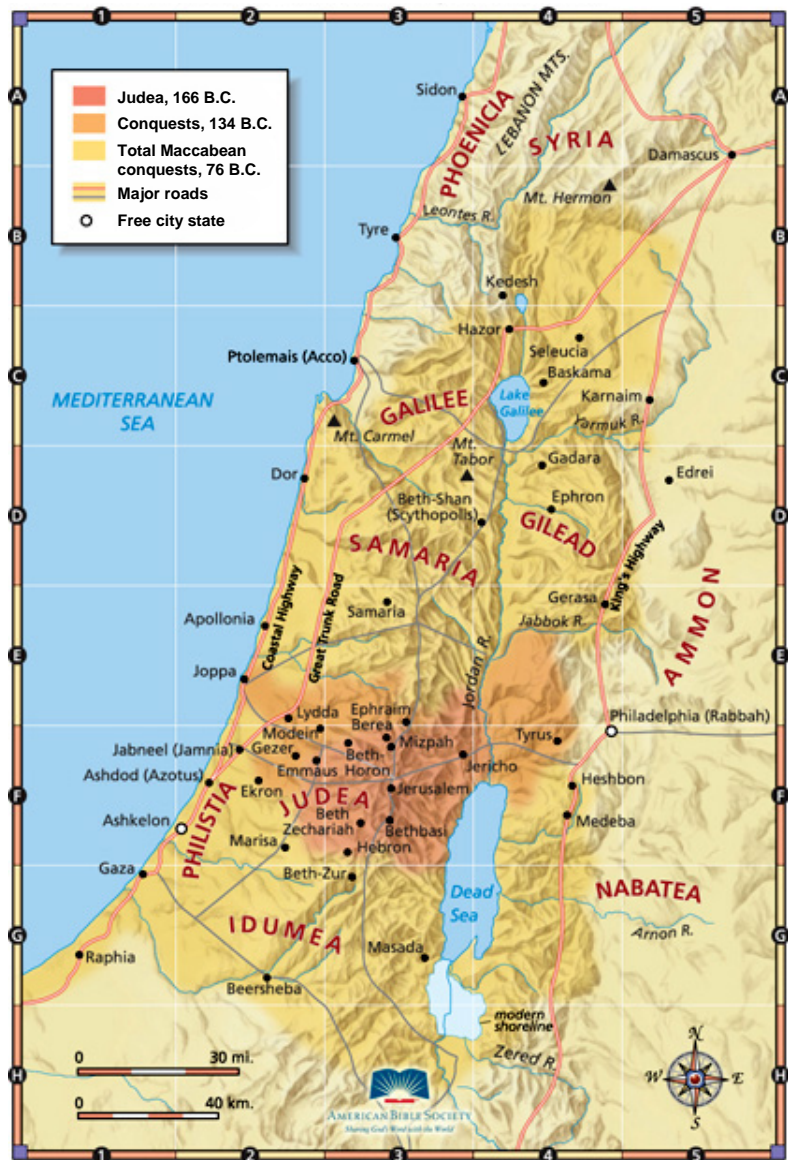
Palestine in the time of the Maccabees, 175 to 63 B.C.

According to historical sources including the books of 1 Maccabees and 2 Maccabees and the first book of The Wars of the Jews by the Jewish historian Josephus (37 CE–c.100 CE), the Hasmonean Kingdom rose after a successful revolt by Jews against the Seleucid king Antiochus IV. After Antiochus' successful invasion of Ptolemaic Egypt was turned back by the intervention of the Roman