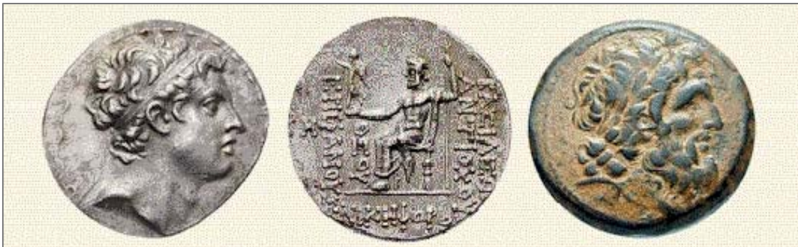
The images on three coins illustrate the “official” metamorphosis of Antiochus IV into a deity

Key Understanding #2 (of Unsealing #1621): Antiochus IV Epiphanes is to be seen prophetically as the epiphany of the Antichrist child in contrast to Jesus Christ as the epiphany of the Christ child.